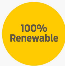
Good Energy fuel mix