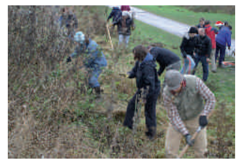
Our 2008 Christmas party. Working alongside Climate Friendly Bradford-on-Avon to clear the riverbank for tree planting.